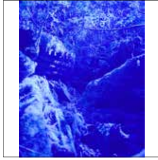
FOREST II, 2017 44cm x 36cm Archival Giclee Print Bespoke Framing Edition of 9 + 2 AP €950