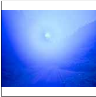
DISSIPATE I, 2017 126cm x 156cm Archival Giclee Print Bespoke Framing Edition of 5 + 1AP €3,500