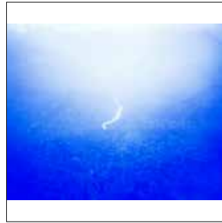
FOREST IV, 2017 126cm x 156cm Archival Giclee Print Bespoke Framing Edition of 5 + 1AP €3,500