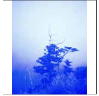
BLUE TREE, 2017 106cm x 86cm Archival Giclee Print Bespoke Framing Edition of 5 + 2 AP €2,200