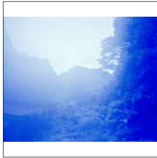
DISSIPATE II, 2017 126cm x 156cm Archival Giclee Print Bespoke Framing Edition of 5 + 1AP €3,500