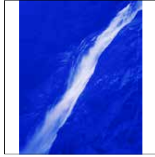
WATERFALL II, 2017 106cm x 86cm Archival Giclee Print Bespoke Framing Edition of 5 + 2 AP €2,200