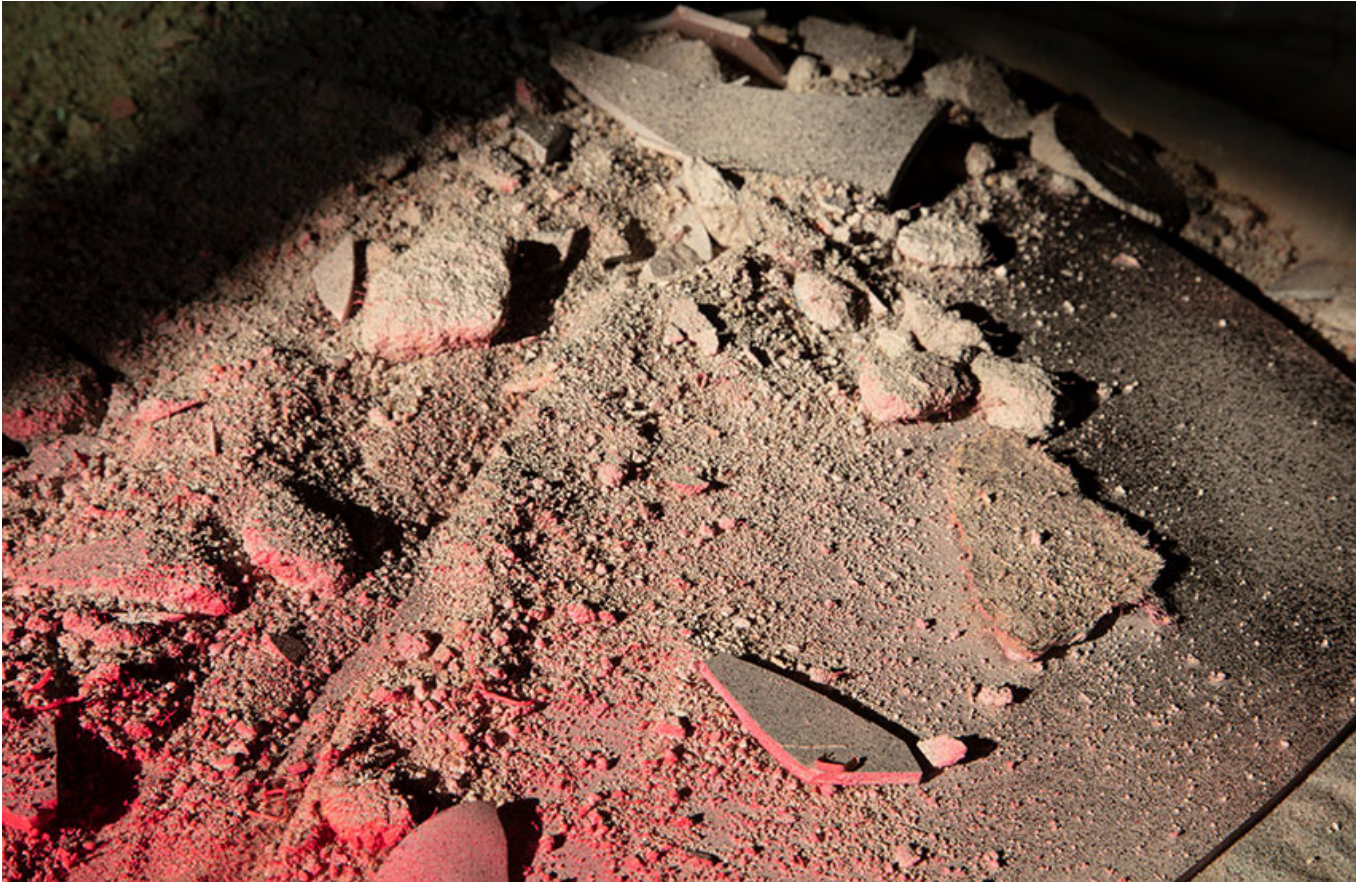
© Jo Dennis, from the series, Shifting Sands - The Waste Land (2020)