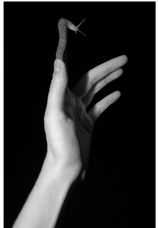
© Elena Helfrecht, from the series, Inwards (2020)