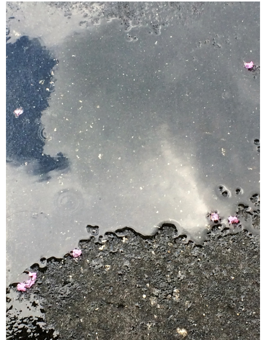
from the series, Beyond Here Is Nothing (2017)