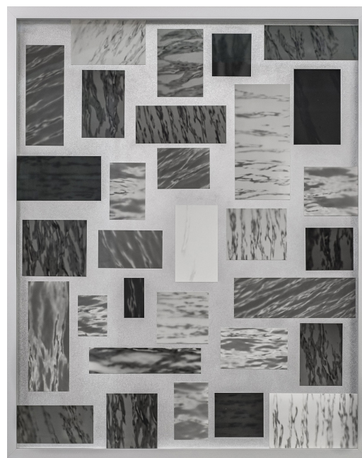
© Martin Seeds, from the series, Surface Tensions (2020)